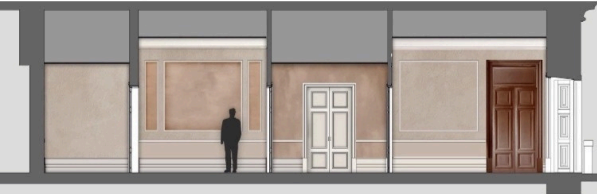
ALÇADO TIPO SUITES