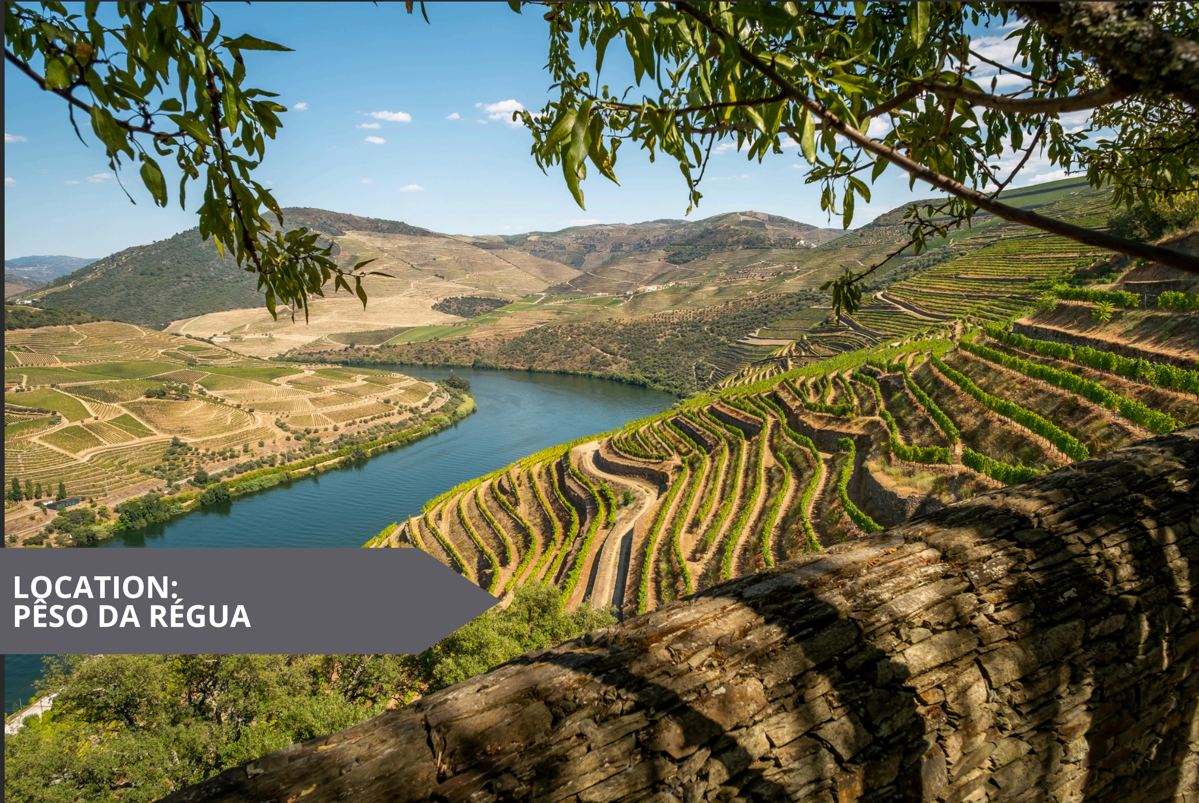
LOCATION: PÊSO DA RÉGUA