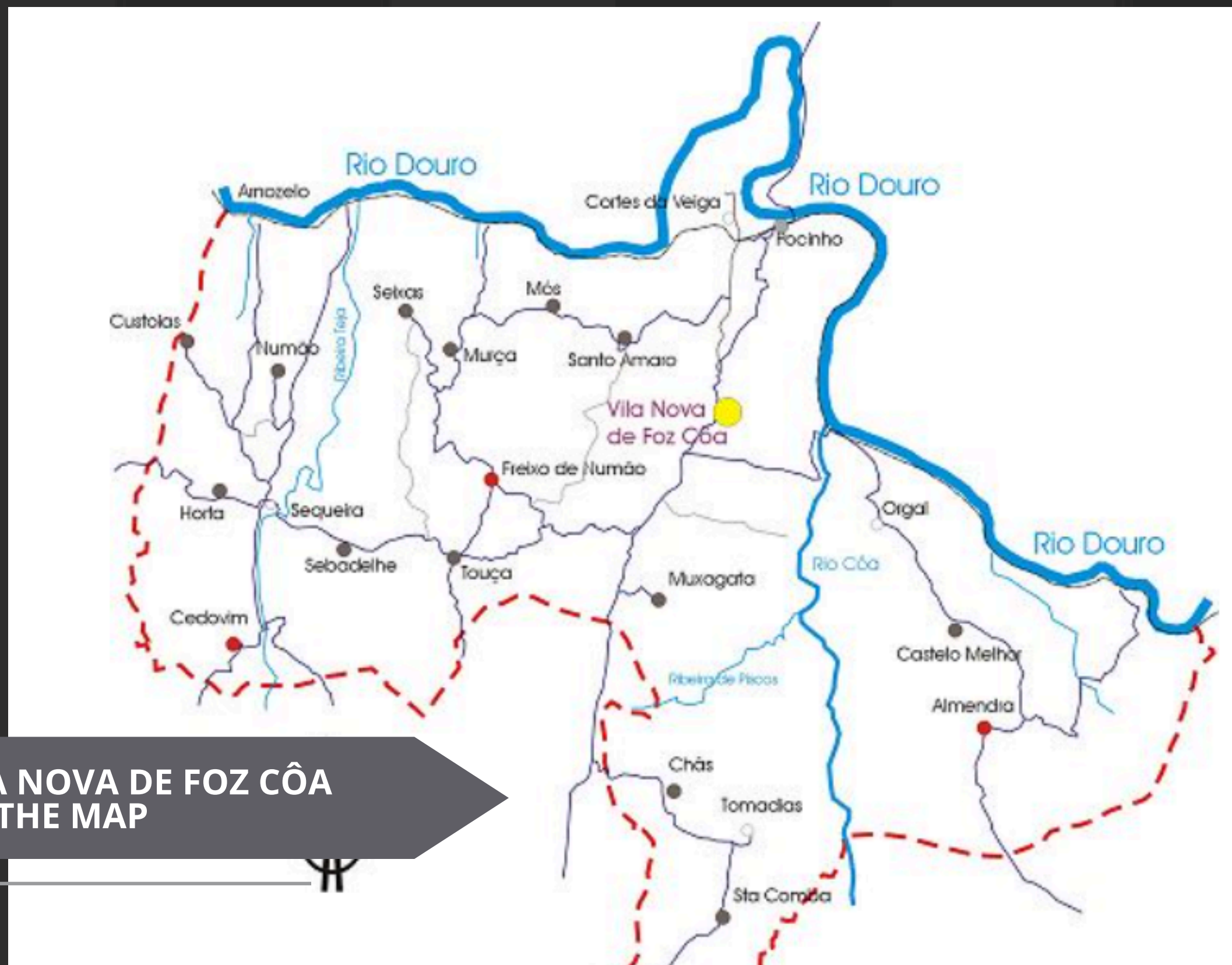
VILA NOVA DE FOZ CÔA ON THE MAP